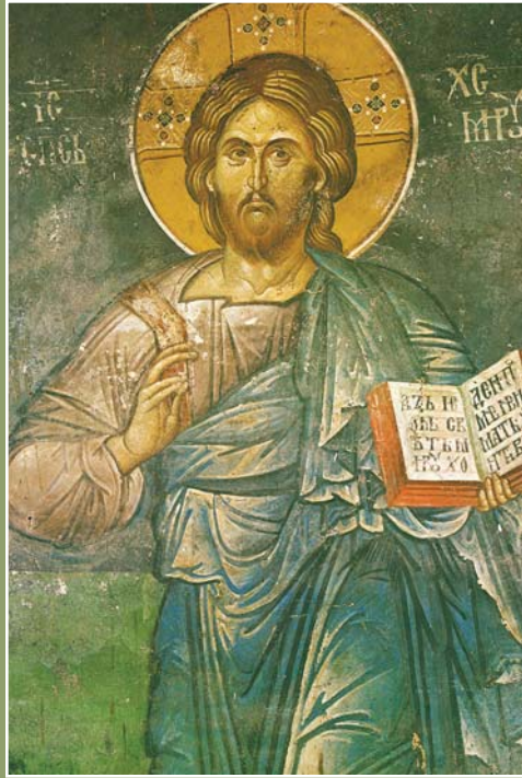
Icons used in this booklet compliments of St. Isaac of Syria Skete www.skete.com