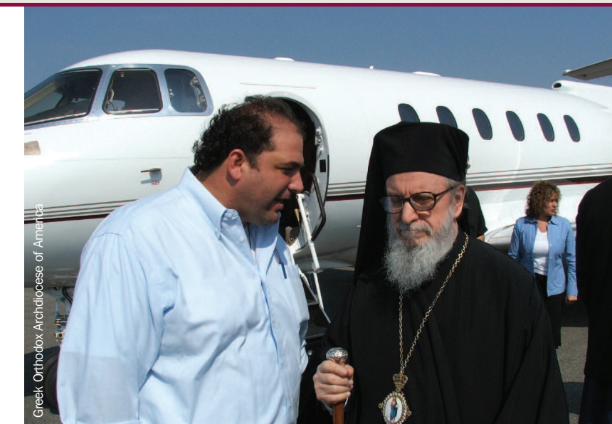
Greek Orthodox Archbishop of America