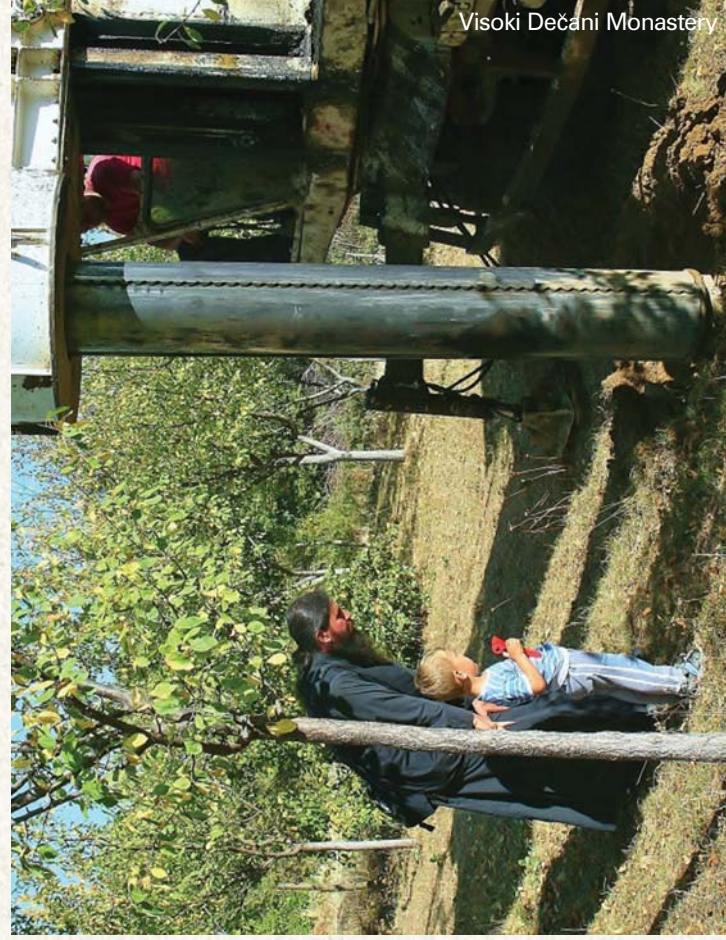
Visoki Dečani Monastery

Fifteen years after NATO bombings and ensuing conflicts in Kosovo, poverty and isolation continue to challenge thousands of families returning to their homes. Your support helps these vulnerable families grow more productive farms, create a better learning environment for their children, and improve their quality of life.