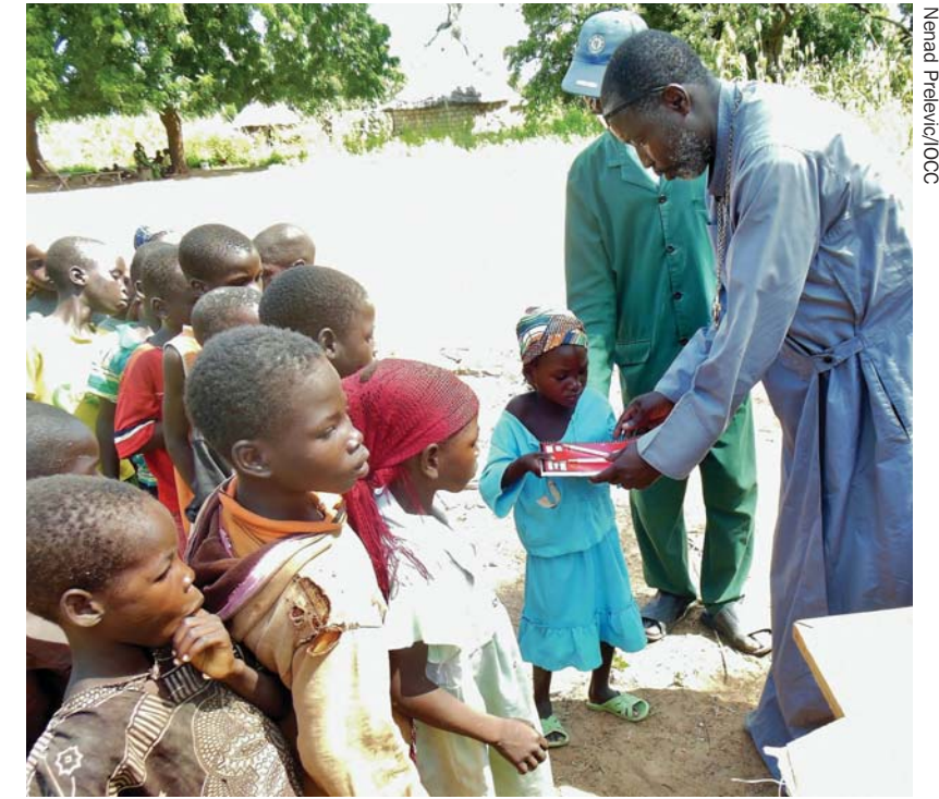
Working in cooperation with the Holy Orthodox Metropolis of Cameroon, IOCC is helping to improve education for Cameroon's school-aged children with the distribution of textbooks and school kits filled with notebooks, pencils and rulers.

We do live in troubled times, and the necessary dialogue to restore social justice, to achieve peace among enemies, and to bring healing to our world requires an honest conversation that cannot avoid the unpleasant realities facing our sisters and brothers who are hungry : literally for food, or for