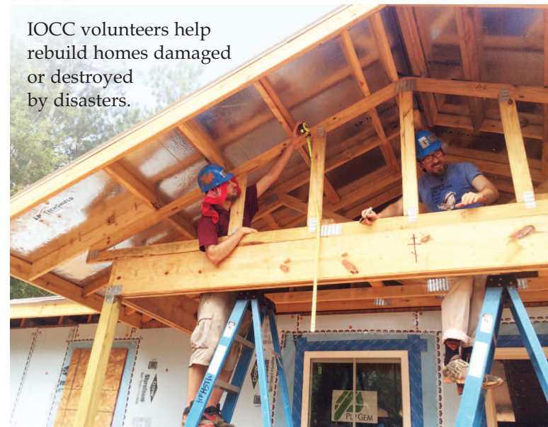
IOCC volunteers help rebuild homes damaged or destroyed by disasters.

It was indeed a special week of service, outreach, and giving of ourselves to others. We completely replaced a roof of a family home which had been destroyed by a hurricane a year earlier; we spent time preparing meals to feed over 1,000 people in need; we were given an awesome opportunity to give of ourselves.