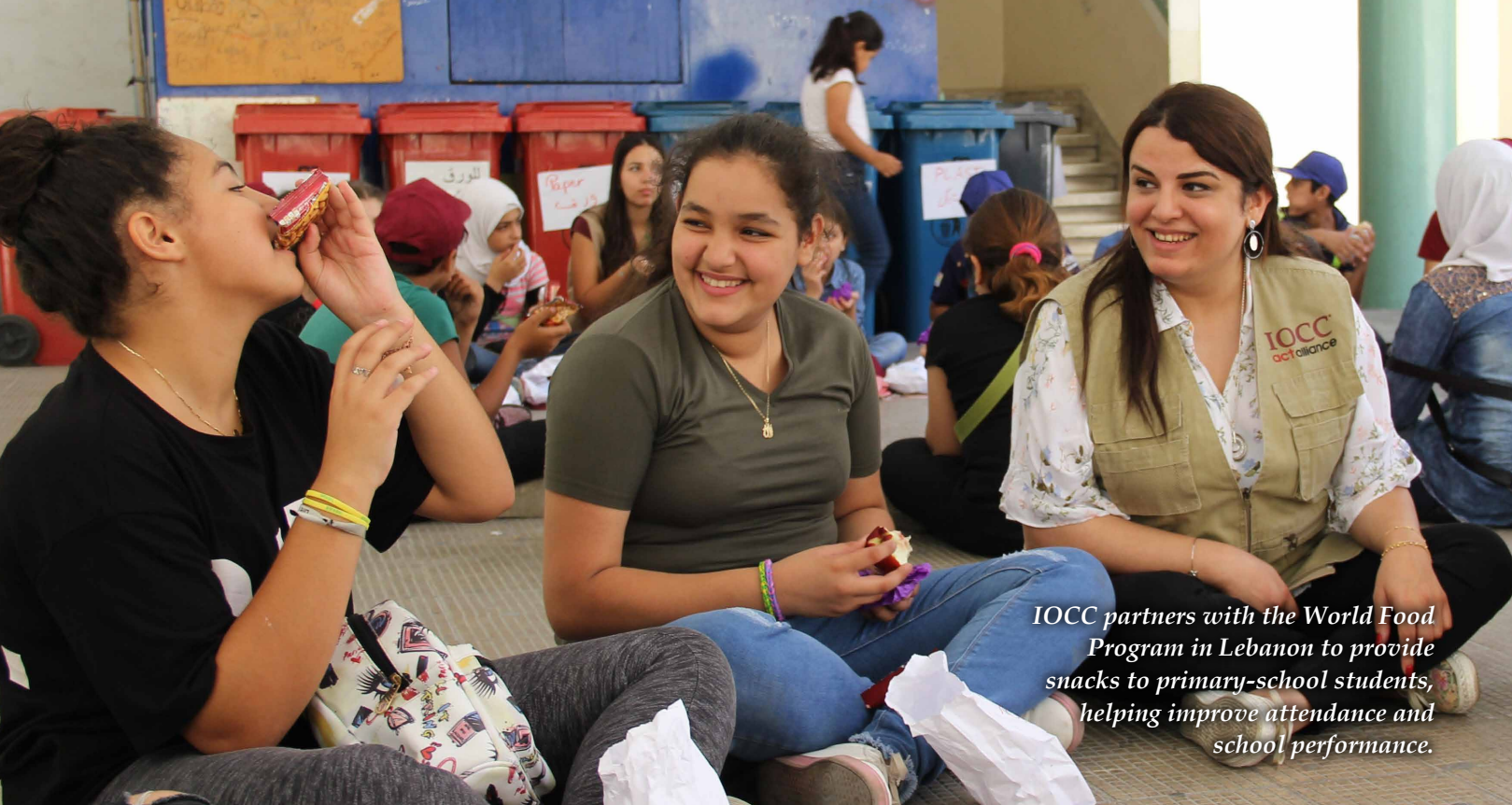
IOCC partners with the World Food Program in Lebanon to provide snacks to primary-school students, helping improve attendance and school performance.