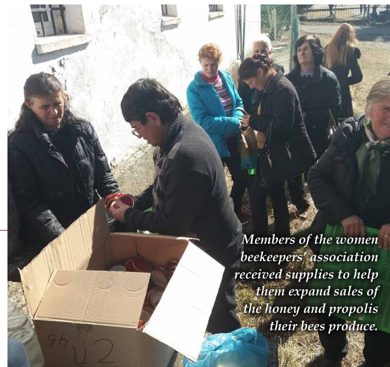
Members of the women beekeepers' association received supplies to help them expand sales of the honey and propolis their bees produce.

A grant from IOCC has helped Diakonia Agapes (the social, development, and relief office of the Orthodox Autocephalous Church of Albania) organize and fund additional learning opportunities for this group of women from seven villages across Shpati. Beekeeping is a local tradition and source of income there, and the women manage between 4 and 30 beehives each. Many have faced challenges maintaining their colonies' productivity.