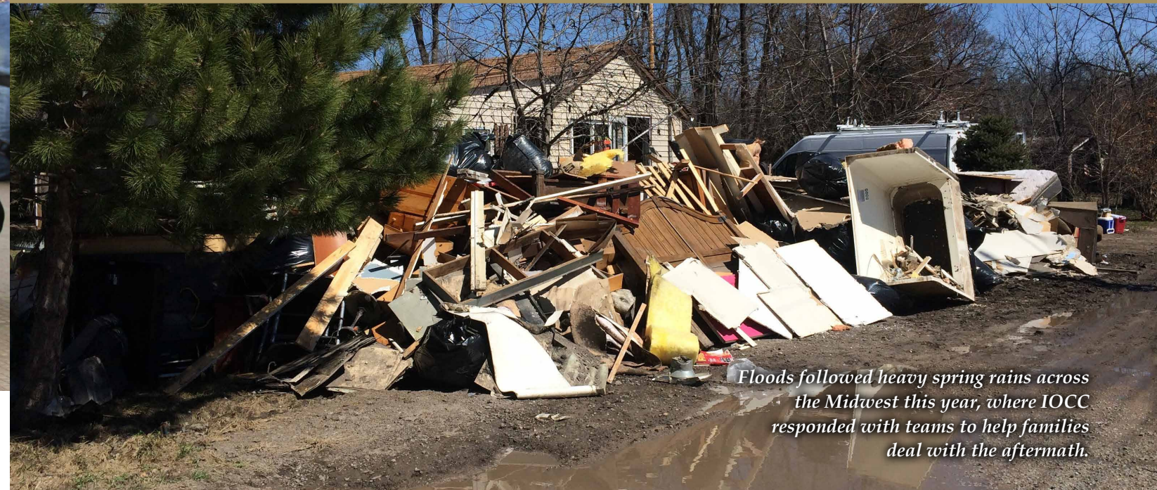
Floods followed heavy spring rains across the Midwest this year, where IOCC responded with teams to help families deal with the aftermath.