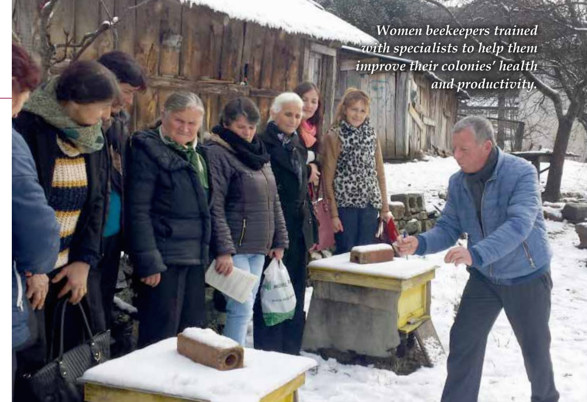
Women beekeepers trained with specialists to help them improve their colonies' health and productivity.

Because the beekeepers live and work in isolated areas, the chance to learn as a group and develop connections with other women farmers is valuable. Association members swap stories and learn from each other; membership also offers access to resources. The association received equipment to help members prepare products for market, and the women learned in workshops to collect propolis, a bee product with commercial potential.