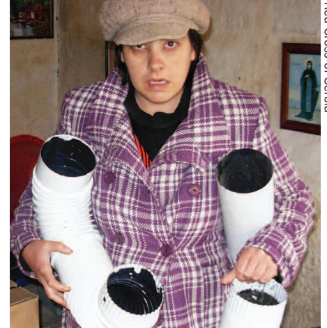
Red Cross of Serbia

IOCC and relief partner Philanthropy, the charitable fund of the Serbian Orthodox Church, responded after the initial quake, assessing the needs of the survivors and supplying them with emergency hygiene kits and personal care products for the elderly. The most recent relief efforts included a shipment of bed linens, baby kits and quilts distributed in cooperation with the Red Cross of Serbia.