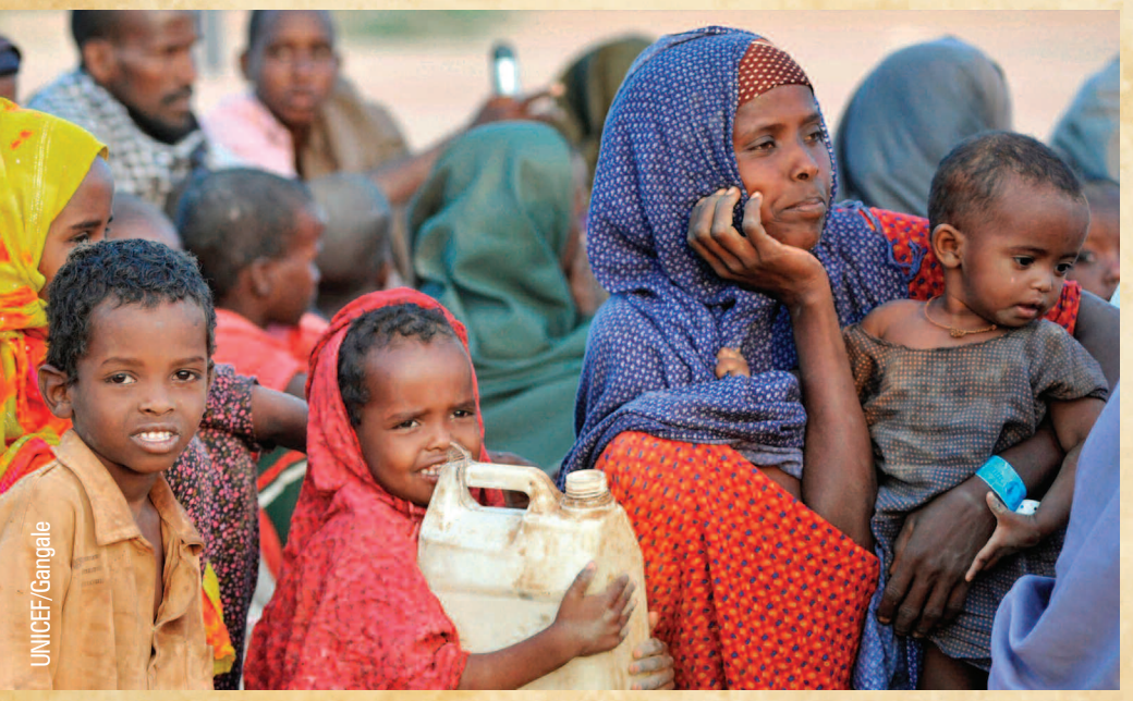
More than 80% of Somalia's famine refugees in Ethiopia are children, and they are facing the greatest struggle to stay alive. Many of them have become separated from parents or lost them to the famine. IOCC is working in partnership with the Ethiopian Orthodox Church to ensure access to basic health support and medicine for the youngest and most vulnerable victims of this famine.