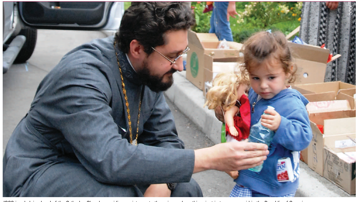
IOCC is a helping hand of the Orthodox Church, providing assistance to those in need, as this priest is to a young girl in the Republic of Georgia.