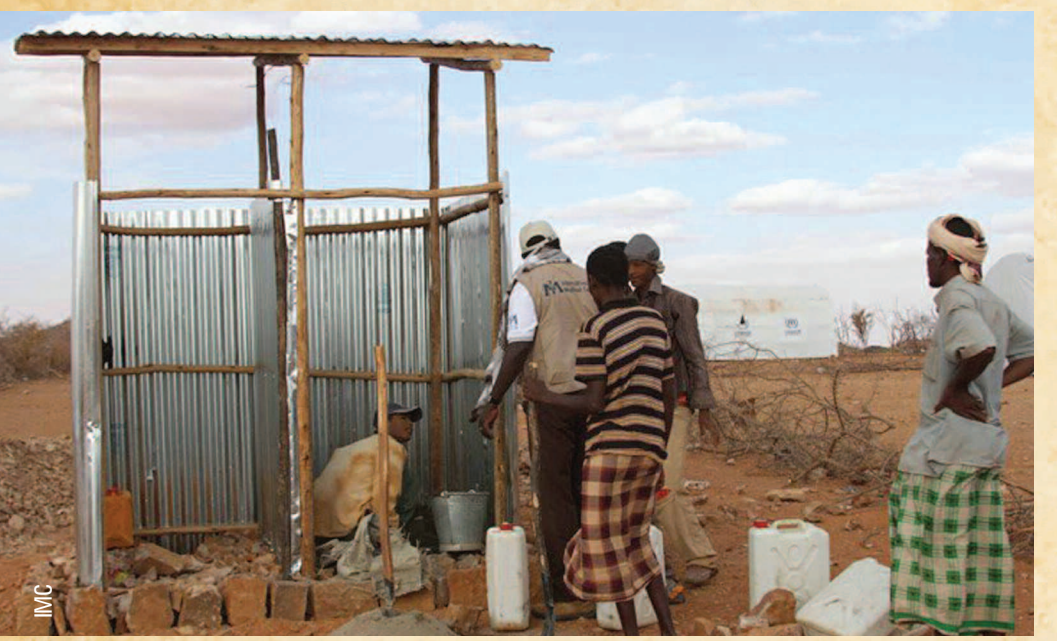
Improving sanitation conditions in a camp filled with more than a quarter million refugees is critical to preventing the spread of disease, especially among young children. IOCC is on the ground in Dollo Ado, Ethiopia, with the materials needed for public latrine construction as well as hygiene and sanitation education.

Your caring support has helped International Orthodox Christian Charities, (IOCC) in cooperation with the Ethiopian Orthodox Church Development and Inter-Church Aid Commission (EOC-DICAC) in delivering much needed medical and public health support, but the magnitude of the crisis is still great and so is the need. Children are the most severely affected, with almost half suffering from extreme malnutrition and an average of ten children losing their lives each day that the famine continues. Your ongoing support through IOCC secures lifesaving nutrition and medical care for these vulnerable young children, and nourishment for the parents in need of strength to care for their families.