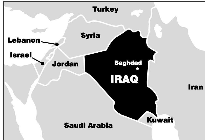
The boundaries depicted do not imply official endorsement by International Orthodox Christian Charities.

Among the items likely to be distributed are family food parcels, first-aid kits, stoves and cooking utensils, tents and mattresses, hygiene parcels, and water pumps. Such assistance will meet some of the most pressing needs in Iraq — hunger, malnutrition, lack of clean drinking water and transmission of diseases.