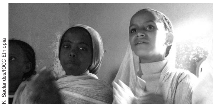
IOCC's program to prevent the spread of HIV/AIDS has reached more than 7 million Ethiopians since 2004. Learn more about IOCC's programs inside and at iocc.org .

P.S. Visit IOCC.org/DayofSharing for useful resources including downloadable inserts for your bulletin.