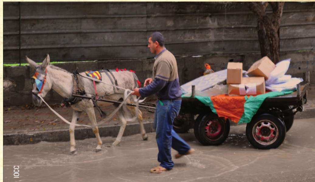
A man from the Al Zeitoun section of Gaza heads home to his family with "Winter Relief" aid packages loaded on his only means of transportation, a donkey cart. Many of the men in this region have been without work for years and must rely on the compassion of supporters like you to help their families survive through the coming winter.