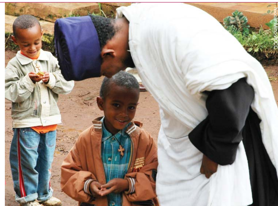
Two young boys welcome small gifts and kind words from an Ethiopian Orthodox monk visiting their orphanage in Asela. Since 2005, IOCC has provided assistance to more than 14,000 orphans in Ethiopia, many of whom lost their parents to AIDS.

Our Lord's most powerful and important message can be found in Matthew 25:31-46. In relating the Parable of the Last Judgment, Christ vividly illustrates what criteria will be used when "...He shall come again in glory to judge the living and the dead." Simply put, our eternal fate will one day be determined by how we respond to the basic human needs of others. Indeed, we are called upon by our Savior to feed those who are hungry, to offer drink to those who are thirsty, to offer clothing to those who have none and to visit and offer comfort to the ill and imprisoned. He emphatically reminds us that when we do these things for the least of His brethren, it is as if we have acted charitably towards our Master Himself.