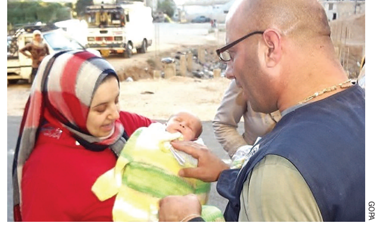
SYRIA: As thousands of Syrian mothers struggle to keep their children warm this winter, IOCC and church partner, the Greek Orthodox Patriarchate of Antioch and All the East (GOPA) is responding with sweater sets made by displaced Syrian women taught to knit through a cash-for-work program. The new skills help provide vital income and displaced Syrian children benefit by receiving warm clothes to protect them against bitter cold.