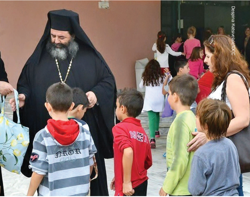
Working in cooperation with Apostoli, the humanitarian arm of the Church of Greece, IOCC is providing the country's children in need with school kits filled with essential supplies.