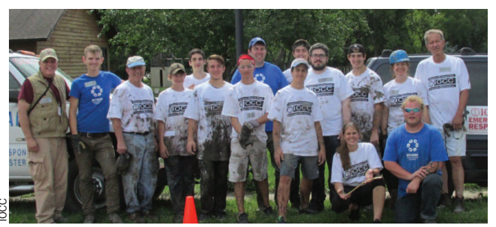
USA: IOCC volunteers joined relief workers from NECHAMA Jewish Response to Disaster in Iowa last July to help families clean out their homes damaged by devastating summer floods in the Midwest. As the newest member of the national Voluntary Organizations Active in Disaster, IOCC will belong to the largest US network of volunteer disaster response agencies prepared to aid American families and communities before and after disasters.