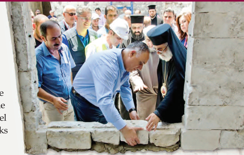
Christian families gather to witness the launch of an Orthodox elementary school rehabilitation project in Homs, Syria.