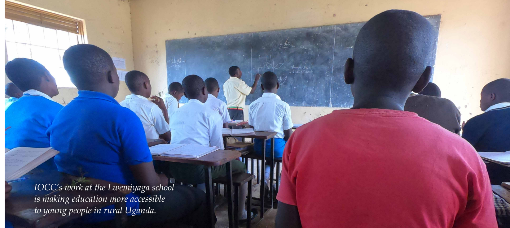
IOCC's work at the Lwemiyaga school is making education more accessible to young people in rural Uganda.