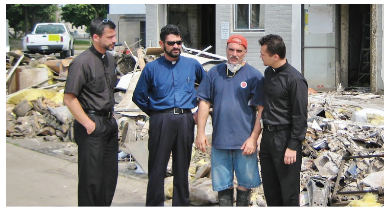
IOCC Frontliners serve in the wake of natural or man-made crises, offering emotional and spiritual care to those affected.