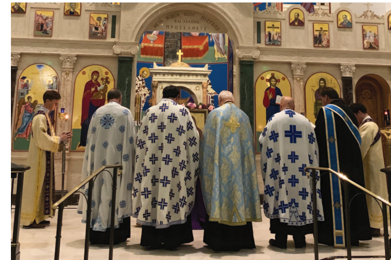
Priests serving together during an IOCC-OCF Real Break home build in Houston, Texas.

My family and I are thankful for the amazing work of IOCC and the way it has brought us closer to the Orthodox clergy and faithful of the Orthodox communities in the regions of the United States that we have been blessed to serve.