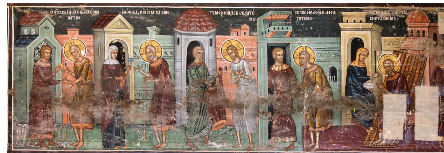
Fresco depicting Matthew 25 in the refectory at the Monastery of Dionysiou.