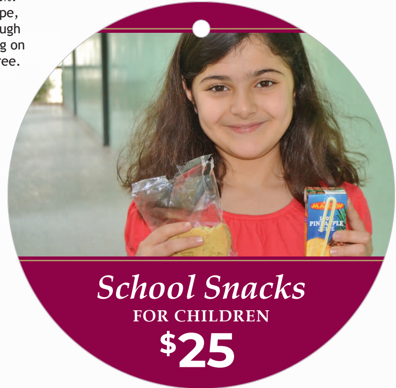
Ornament #2 Front | 4 X 4 Circle Hang Tag