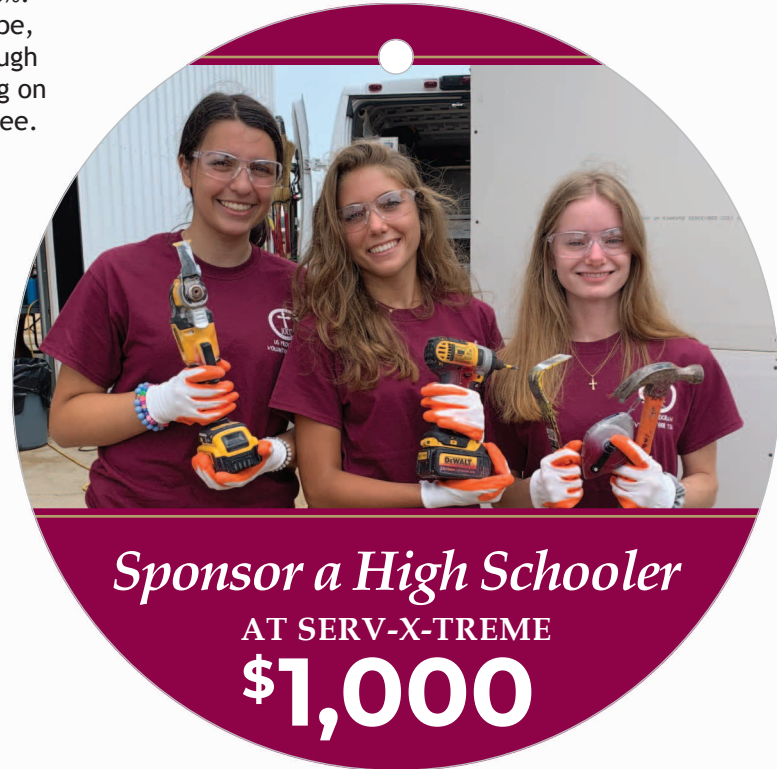
Ornament #10 Front | 4 X 4 Circle Hang Tag