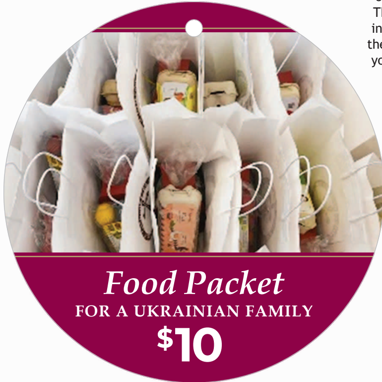
Ornament #1 Front | 4 X 4 Circle Hang Tag

Print all pages 2-sided with your printer “scale” option set to 100%. Then trim to shape, insert string through the hole, and hang on your Christmas tree.