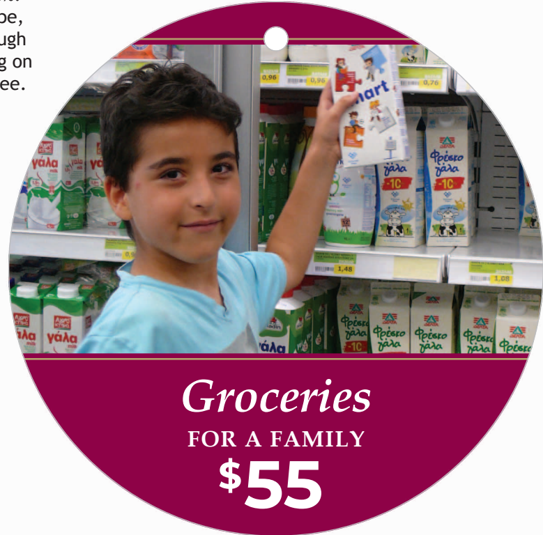
Ornament #4 Front | 4 X 4 Circle Hang Tag