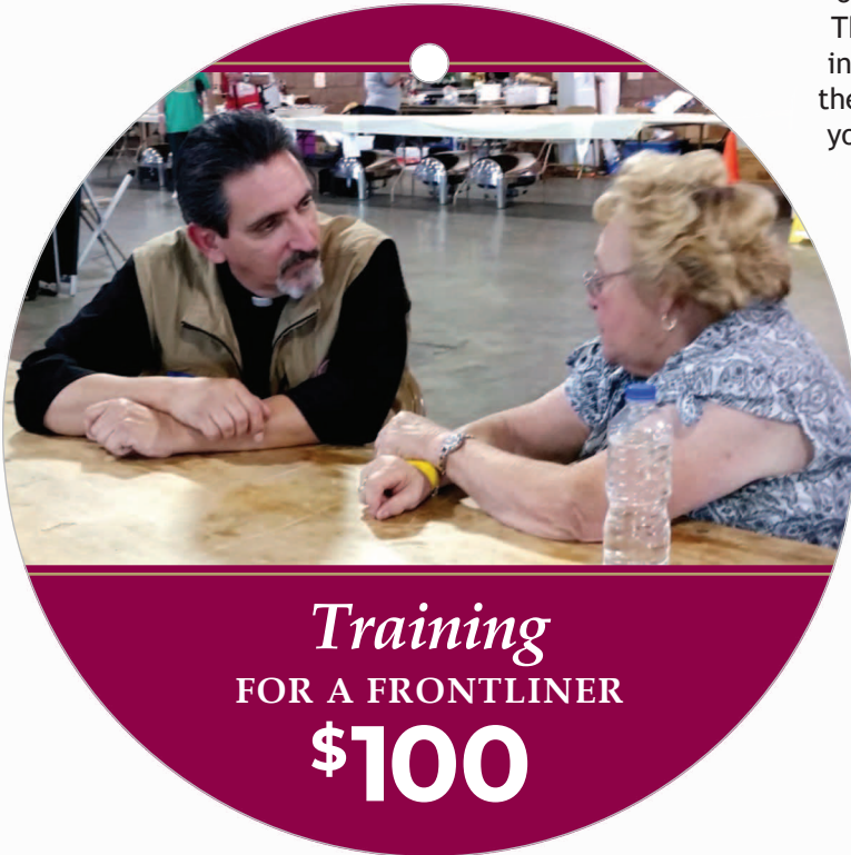
Ornament #7 Front | 4 X 4 Circle Hang Tag

Print all pages 2-sided with your printer “scale” option set to 100%. Then trim to shape, insert string through the hole, and hang on your Christmas tree.