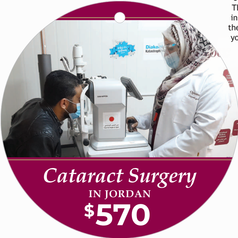
Ornament #9 Front | 4 X 4 Circle Hang Tag

Print all pages 2-sided with your printer “scale” option set to 100%. Then trim to shape, insert string through the hole, and hang on your Christmas tree.