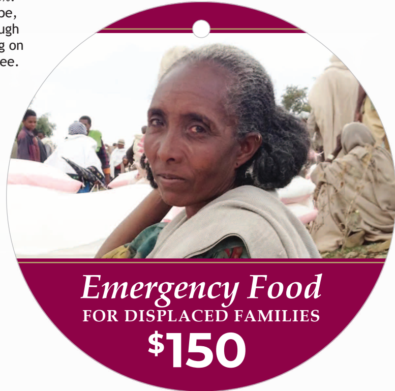
Ornament #8 Front | 4 X 4 Circle Hang Tag