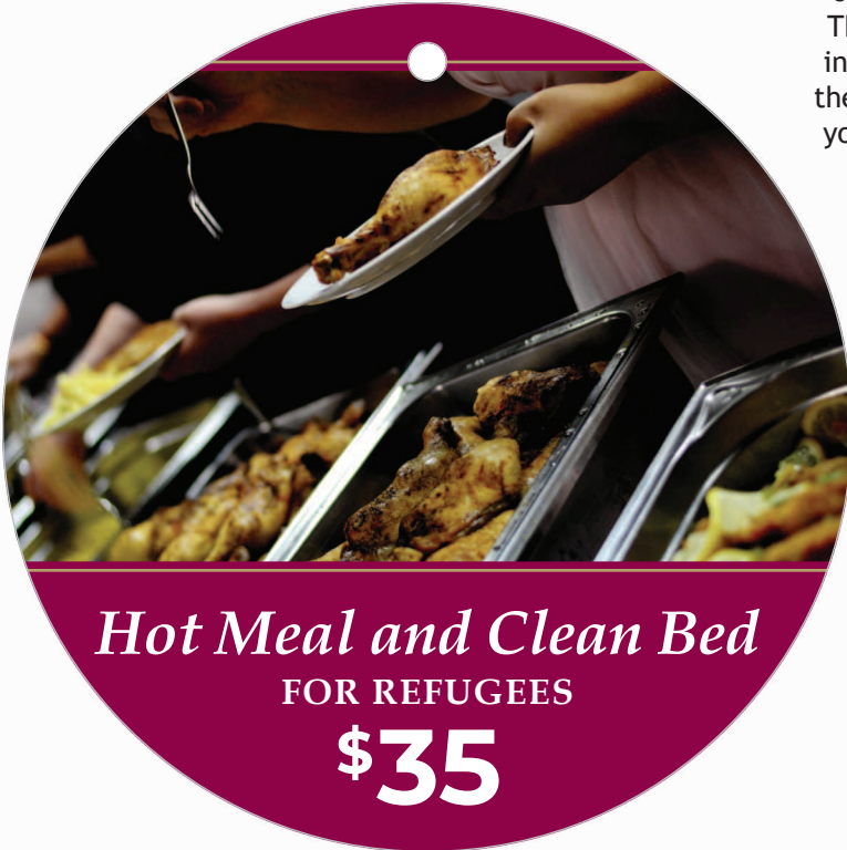
Ornament #3 Front | 4 X 4 Circle Hang Tag

Print all pages 2-sided with your printer “scale” option set to 100%. Then trim to shape, insert string through the hole, and hang on your Christmas tree.