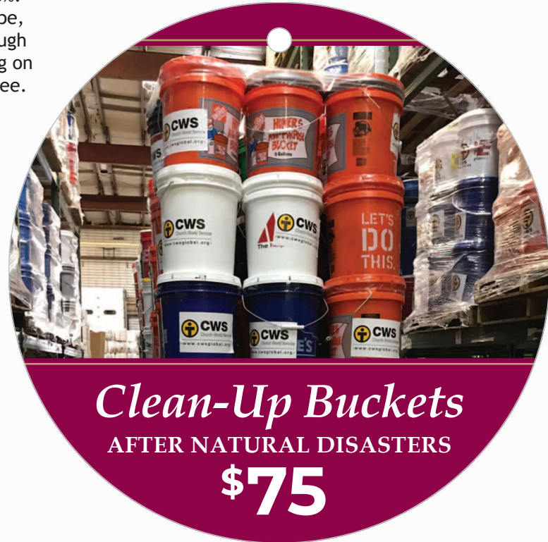
Ornament #6 Front | 4 X 4 Circle Hang Tag