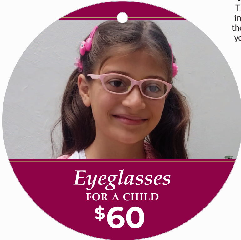
Ornament #5 Front | 4 X 4 Circle Hang Tag

Print all pages 2-sided with your printer “scale” option set to 100%. Then trim to shape, insert string through the hole, and hang on your Christmas tree.