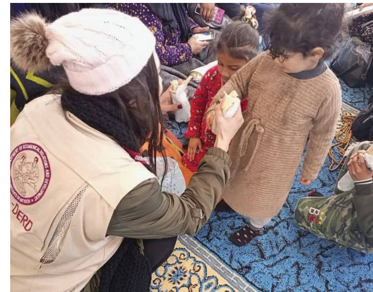
IOCC continues to work closely with partners on the ground to meet the needs of people displaced by the earthquakes in Syria and Turkey.

In response to the earthquakes in Turkey and Syria in early 2023, our parish decided to make another small offering. This time it consisted of pies, cakes, and other baked goods prepared by a few parishioners and yours truly. We held a bake sale timed for western Easter, the proceeds of which would support IOCC's relief efforts for the survivors of those tragedies. Thanks to effective promotion on social media and through contacts in the community, an ample number of customers paid in advance and picked up their delicacies in our hall on the afternoon of Lazarus Saturday. The effort raised $650 for IOCC, which far exceeded our expectations. The Lord multiplied the small offerings from our kitchens to bless suffering people as a sign of His kingdom.