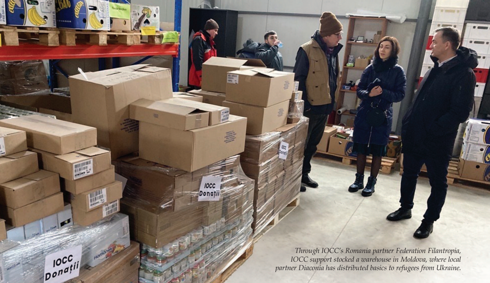
Through IOCC's Romania partner Federation Filantropia, IOCC support stocked a warehouse in Moldova, where local partner Diaconia has distributed basics to refugees from Ukraine.