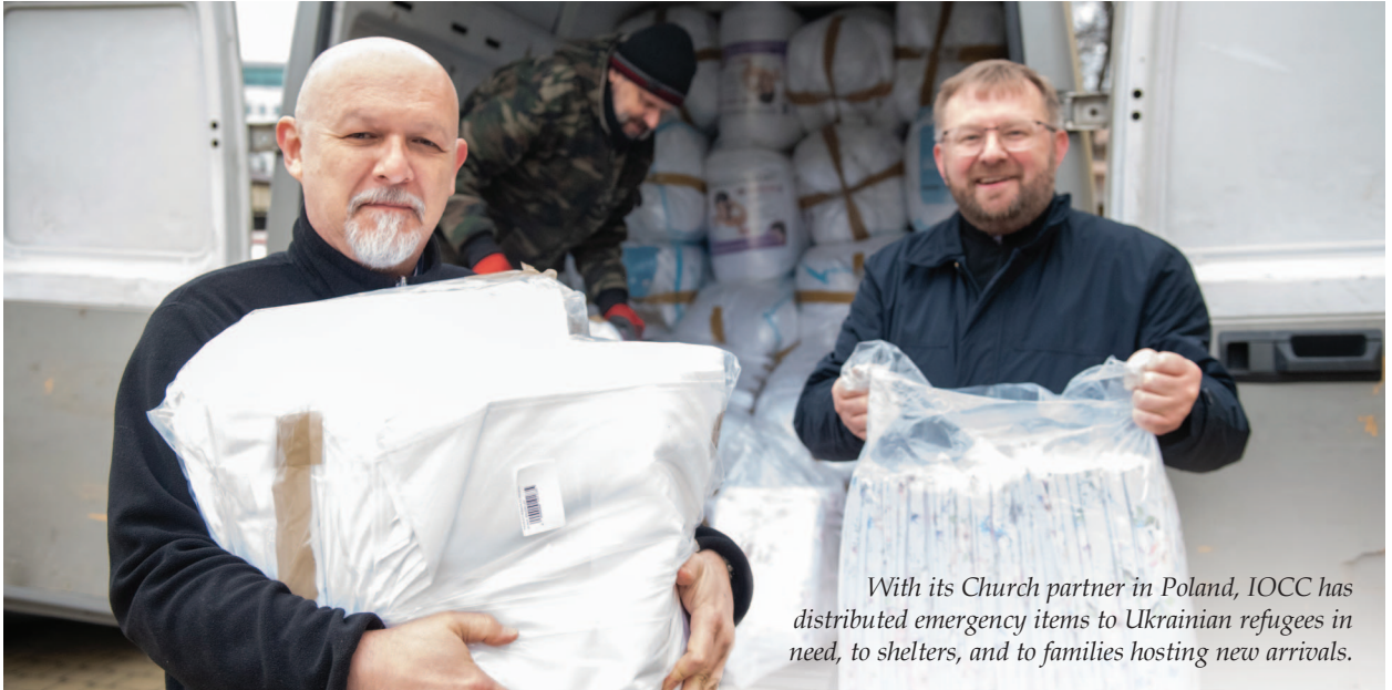
With its Church partner in Poland, IOCC has distributed emergency items to Ukrainian refugees in need, to shelters, and to families hosting new arrivals.

International Orthodox Christian Charities (IOCC) has a long history of humanitarian and development programming in Eastern Europe, beginning in the early 1990s following the collapse of the Soviet Union. With strong partner relations across the region, particularly within the network of the Orthodox Church, and a portfolio of humanitarian response in Poland, Romania, Ukraine, and the western Balkans, IOCC is uniquely positioned to serve the millions now in need across the region as a result of the conflict in Ukraine.