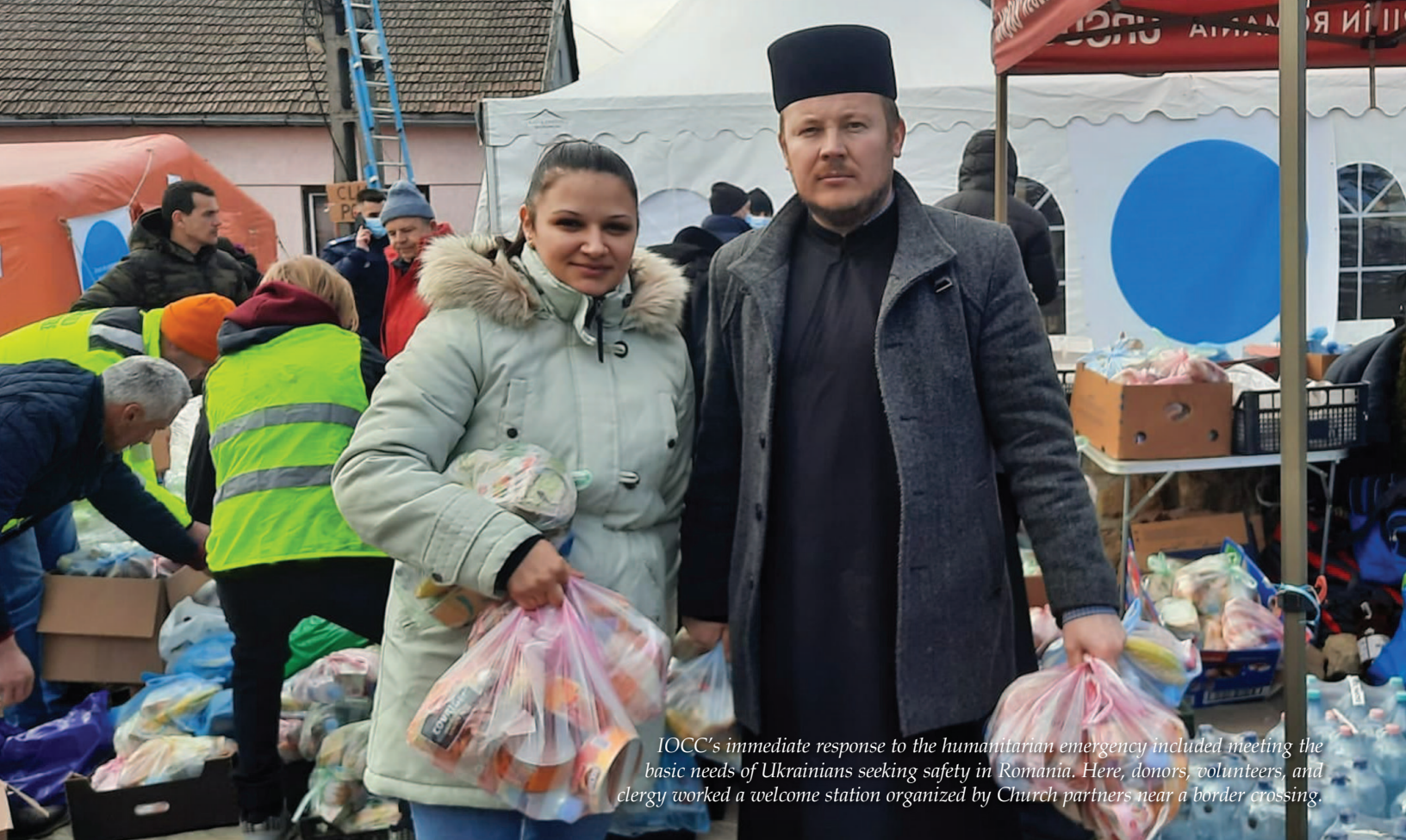
IOCC's immediate response to the humanitarian emergency included meeting the basic needs of Ukrainians seeking safety in Romania. Here, donors, volunteers, and clergy worked a welcome station organized by Church partners near a border crossing.